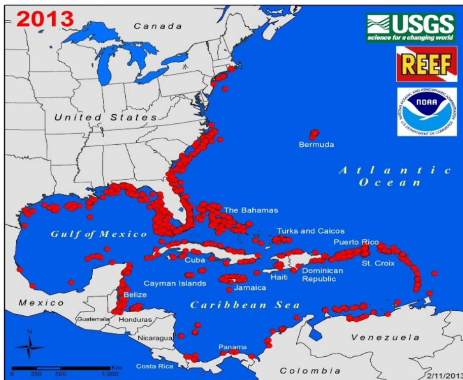
Figure 2. Current distribution of invasive Lionfish in the Caribbean (Updated February 2013) Florida was the first location where lionfish were documented in the Wider Caribbean Region.

In the Wider Caribbean region, lionfish has become a high-risk threat both ecologically and economically.